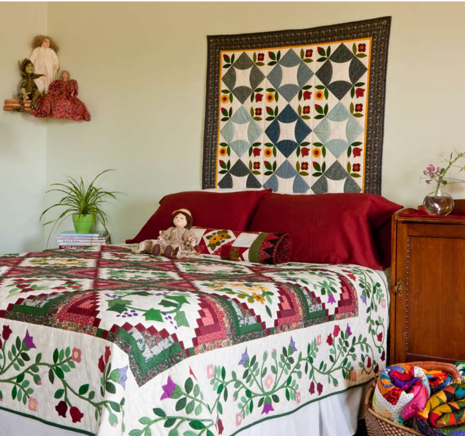
Virginia's love of color and bold design are obvious in every room, even the bedrooms.