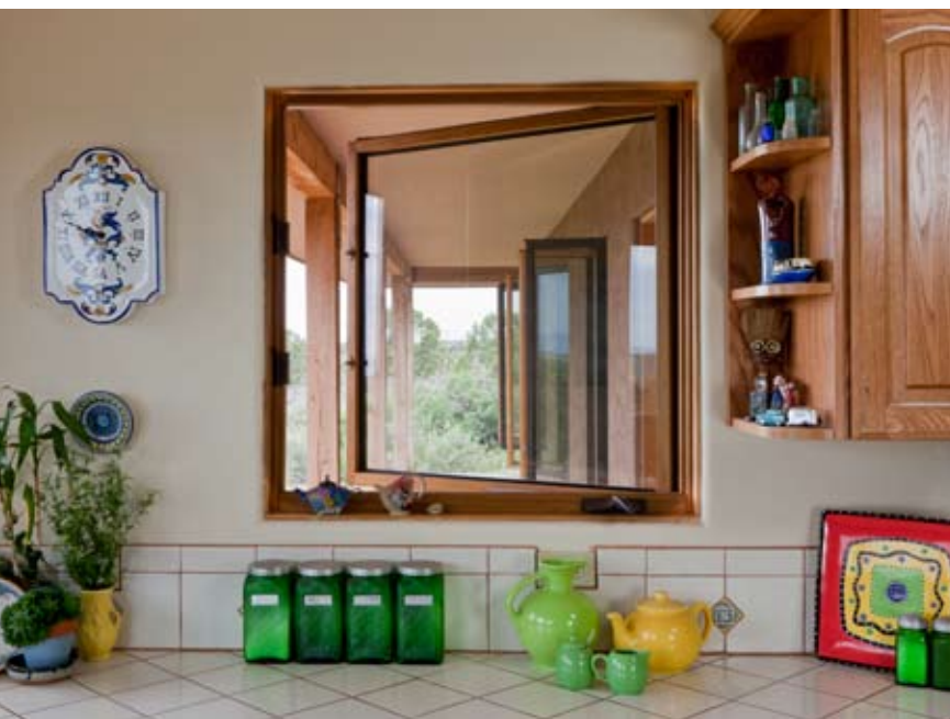
Far-ranging views of the Four Corners area surround the house and give it an expansive, peaceful ambience.

Virginia is a formally trained artist, with a Master's in Fine Arts, and she's worked in many media, including soft sculpture and painting.