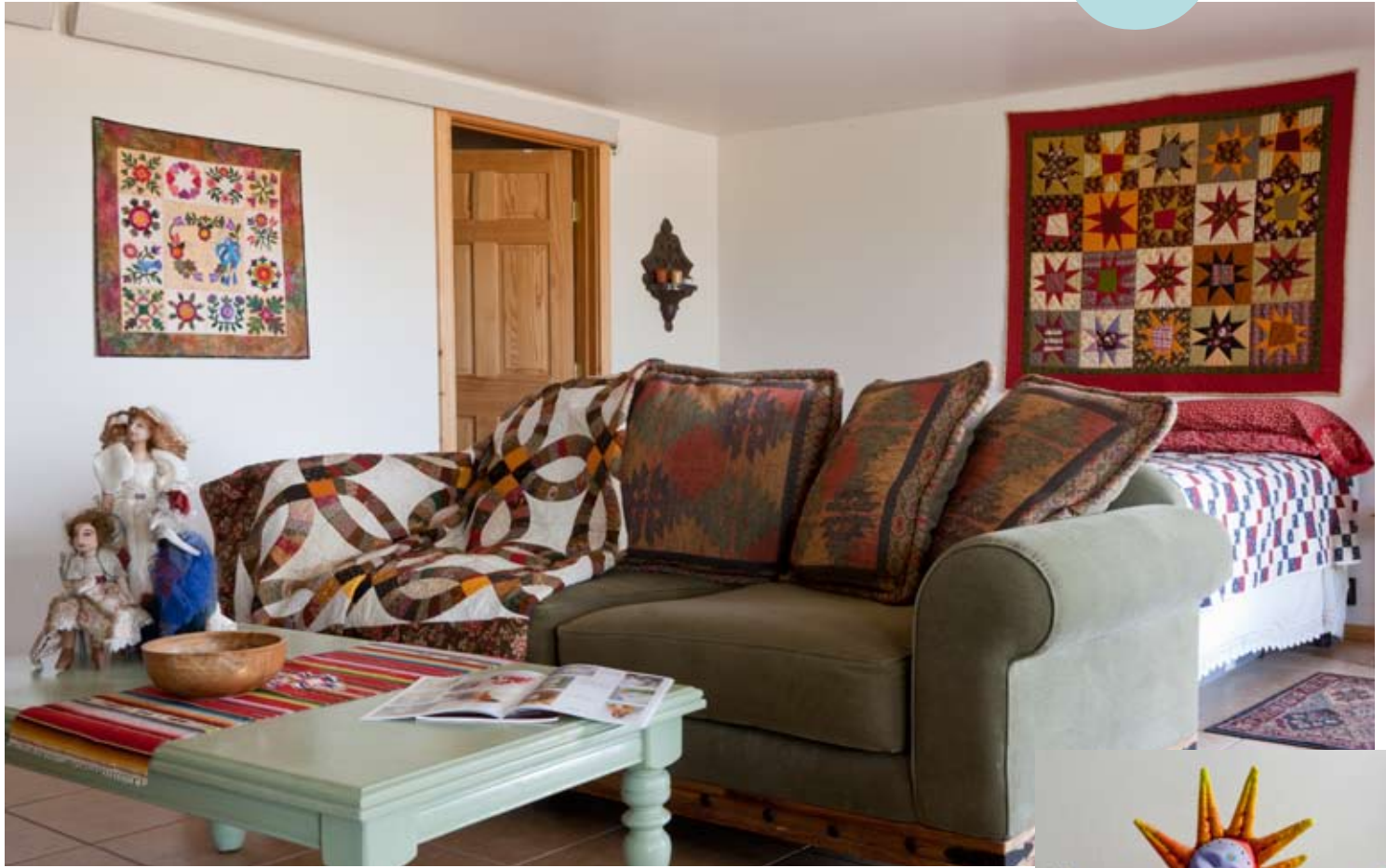
Their airy, bright home is a functional art gallery for her many quilts and custom-made dolls.