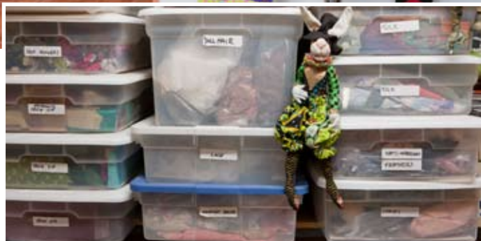
Another view of her studio, and her ample inventory of buttons and trims.

Virginia says she teaches options for students, not rules. And when it comes to her own options for designing, keeping them well organized is the key to knowing what there is to work with.